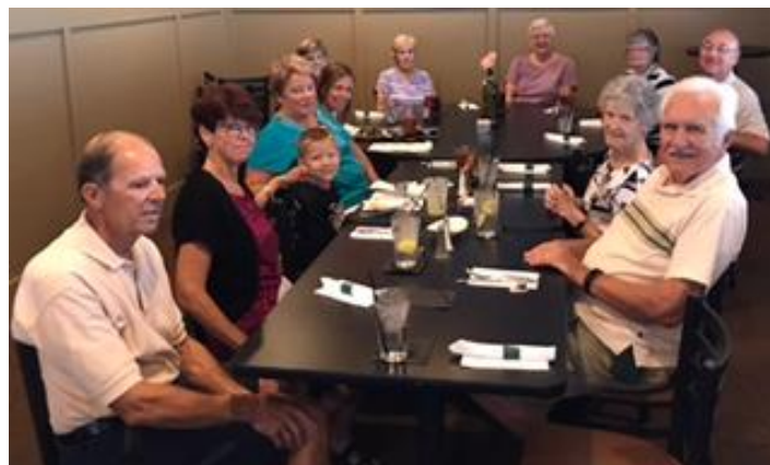
Lunch Bunch Hoffman's Grill